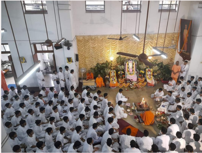
Students during Vidyarthi-Vrata Homa