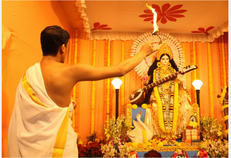
Puja arati being performed by a student of Ramkrishna Mission Vidyamandira

Saraswati Puja, the 'Vani Vandana', was gloriously celebrated in the prestigious college Ramakrishna Mission Vidyamandira, Belur Math, Howrah, on February 14 and February 15, 2024 in the Vimuktananda Hall that was mostly arranged by the students of the college with guidance of revered monks or 'Maharajas'. As a tradition of the college continuing for long years, every students were assigned with particular duties that suits their area of interests. The duties included invitation of guests; decoration that had in it painting of different forms or 'avatars' of Maa Saraswati that were decorated on the main platform where idol was laid and decoration of the entire college campus with 'Alpona' or paintings; arrangement of benches both before and after the puja from the hall; cleaning of the vessels used for puja; bringing the idol; reception and enquiry; 'Puja Bhandar' that had the preparation of the 'Naibedya' or the main