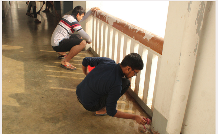
Students cleaning the hostel building

Students' Day is celebrated all over India on October 15, on the birth anniversary of "Missile Man of India", Dr APJ Abdul Kalam. But there are still some extraordinary cases in this ordinary world. In our college, Ramkrishna Mission Vidyamandira student's day is celebrated on 23rd January in a manner of a day organized by students. In Vidyamandira, we the students in 23rd January celebrates the day like a festival where we control the college's hostel and mess by giving a rest to our dear and strict Maharajs and other supporting staffs who with their daily work makes this college a residential college of Ramkrishna Mission. From ringing the morning bell to the serving of launch, students replace the usual people who are there to do those works all over the year.